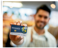
Gift + Loyalty