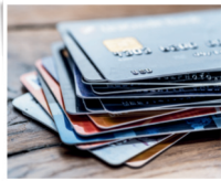
All Major Cards